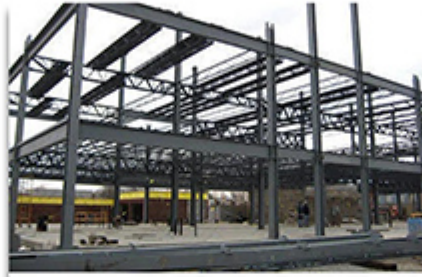
Convention Building / Fabrication Erection