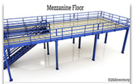
Mezzanine Floor Structure