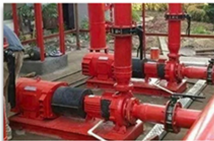
Firehydrant Line Work