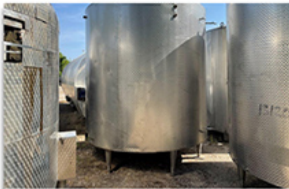
MS & SS Tanks