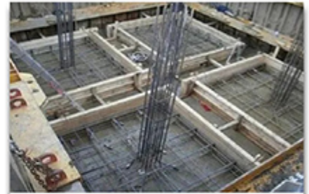
Civil Foundation Work