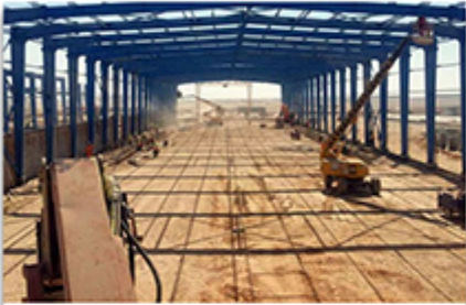
Pre Engineered Building Fabrication Erection