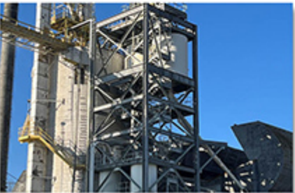
Equipment Fabrication & Erection